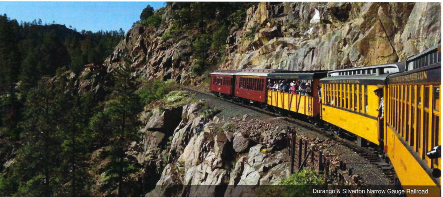
Durango & Silverton Narrow Gauge Railroad

DAY 6 Cumbres & Toltec Scenic Railroad: Your day begins as you board the motorcoach and ride to the Cumbres & Toltec Scenic Railroad, the original Rio Grande Line. This is America's most spectacular narrow gauge steam railroad. Explore 50 miles of wild and rugged territory between Chama, New Mexico and Antonito, Colorado, the highest point on the railroad. Meals: B, L