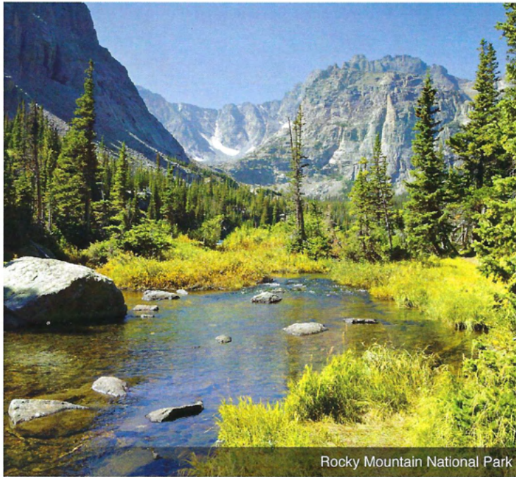
Rocky Mountain National Park