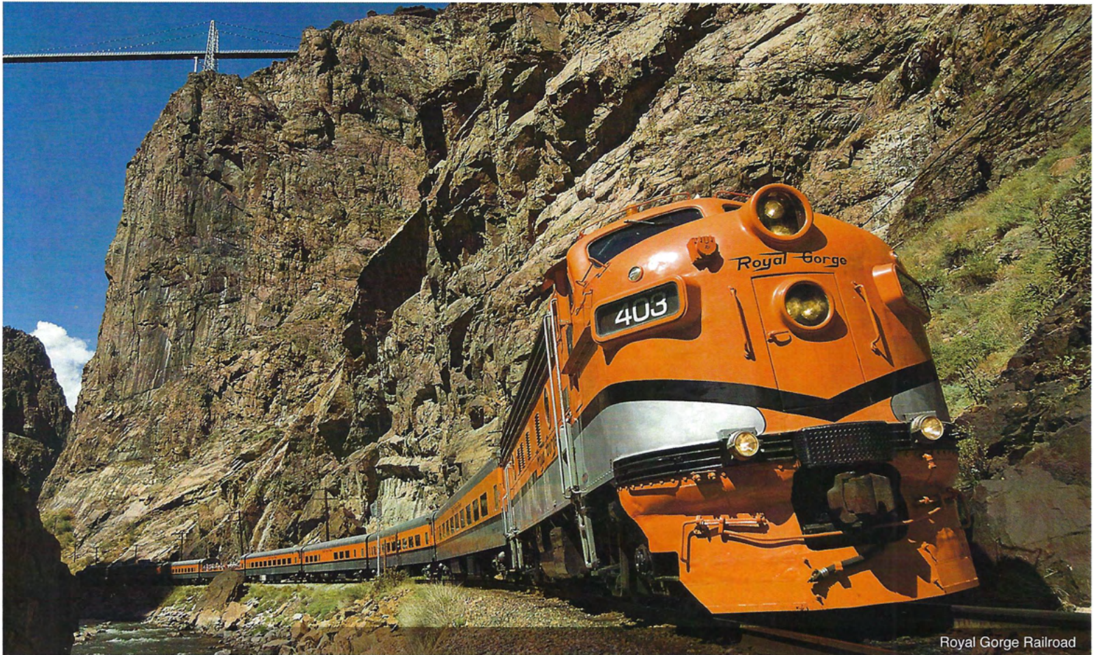
Royal Gorge Railroad